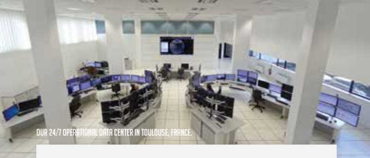
OUR 24/7 OPERATIONAL DATA CENTER IN TOULOUSE, FRANCE.